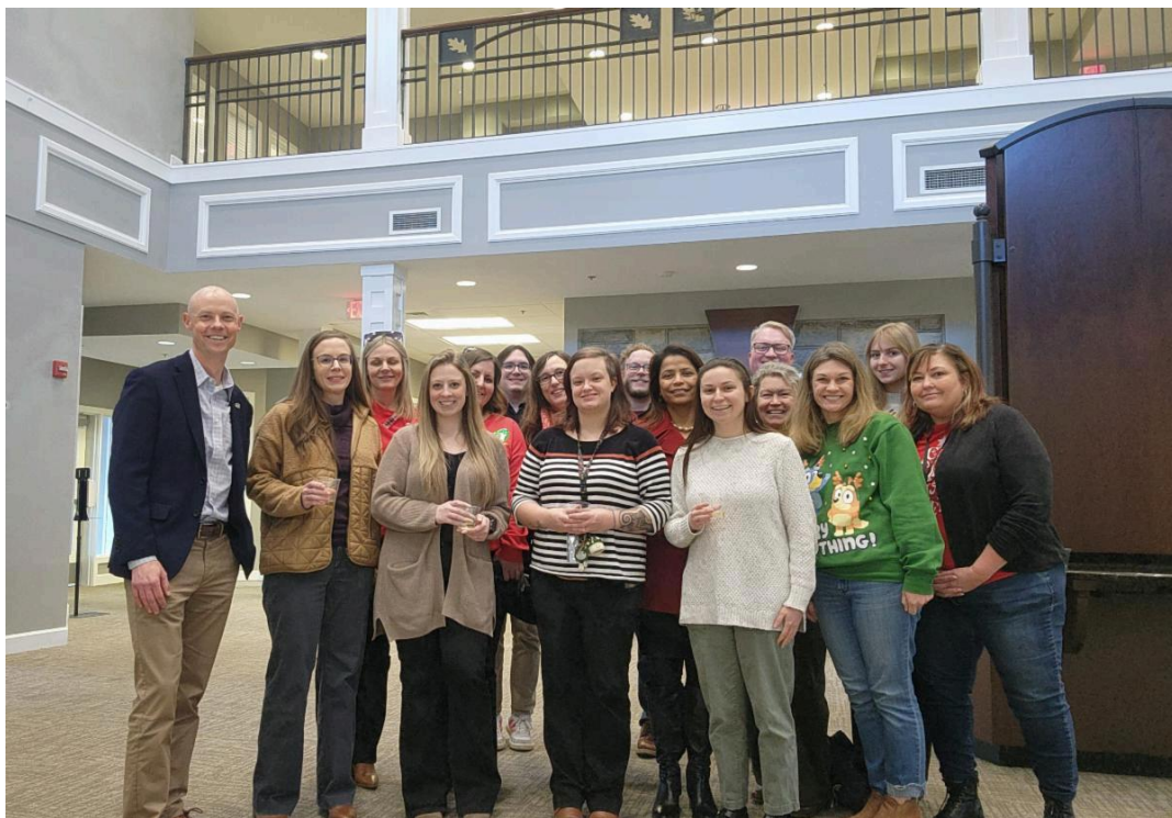
Commission staff toured the new space in December

The Regional Commission was established in 1969. For the first 30 years the agency was located in Radford. The following 25 years the Regional Commission has been housed in Fairlawn at the Pulaski County Innovation Center. The Regional Commission looks forward to many future years serving the New River Valley from Christiansburg.