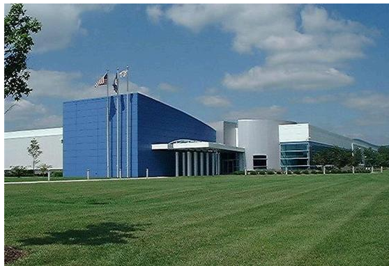
Blue Ridge Commerce Park, Roanoke